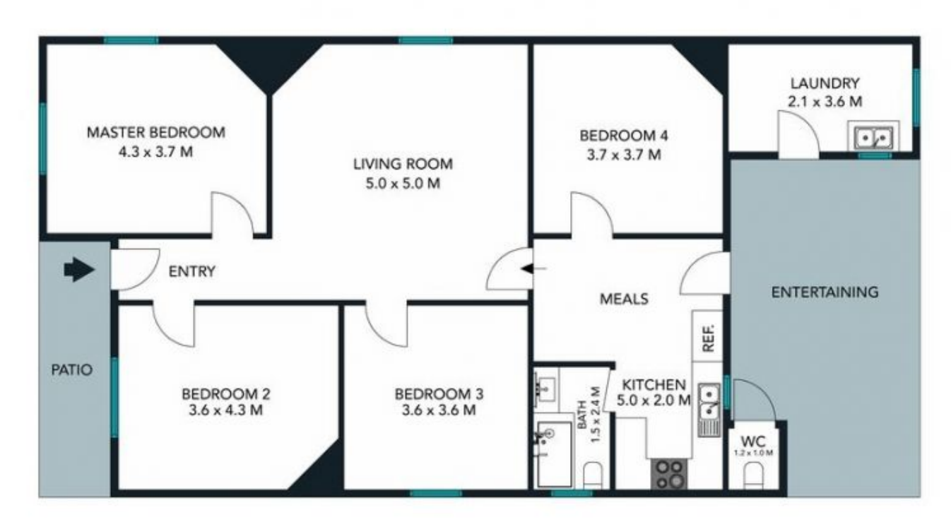
22 Hardie Street Mascot

Disclaimer: All measurements are approximate only. No representation is made by RRE that should be relied upon