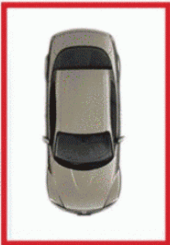
Lockup garage 3.0 x 5.2