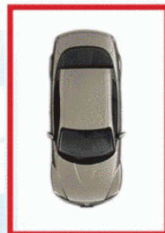
Lockup garage 3.0 x 5.2