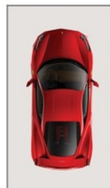
UNDERCOVER SECURITY CARSPACE