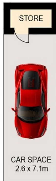
CAR SPACE 2.6 x 7.1m