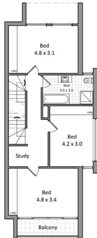
Level 1 floor plan

This diagram is for illustrative purpose only. All reasonable care has been taken in the preparation, but no warranty is given as to the accuracy of the information. This document does not constitute any part of any offer or contract. Dimensions shown are approximate only. Prospective purchasers must rely on their own enquiries. Floor plan by Igor Nedic 0410581805/spinpix.com.au.